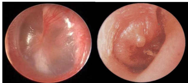
Normal tympanic membrane AOM in 3-year old 13

Otitis media with effusion (OME), also known as “glue ear”, is a collection of non-purulent fluid (effusion) in the middle ear. It is usually seen as a result of AOM, is often asymptomatic, and if persists can lead to hearing impairment. Differentiating between AOM and OME can be challenging.